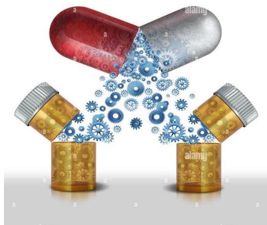
Fig.1: Drug interactions

Combination therapy used in psychiatric practice makes drug interactions more likely & increases the risk of adverse outcomes to patients. In a drug-drug interaction (DDI), the presence of Second drug alters the nature, magnitude, or duration given dose of a first drug. According to recently published study, Medications can a recently published study, psychiatric medications can account for upto to 50% of the ADRs for hospitalized patients with mental illness.[1]Clinicians within the primary care setting are increasingly providing pharmacotherapy management of patients with psychiatric illnesses, with over 25% of primary care patients seeking care for major depression and 14% for schizophrenia. Factors Include the potency & concentration drugs involved, the therapeutic index balanced between efficacy and toxicity, presence of active metabolites,& the extent of the metabolism the Substrate drug.[2]More than 100,000 possible detrimental drug-drug interactions (DDIs) have been documented in the medical literature and pharmaceutical company data.